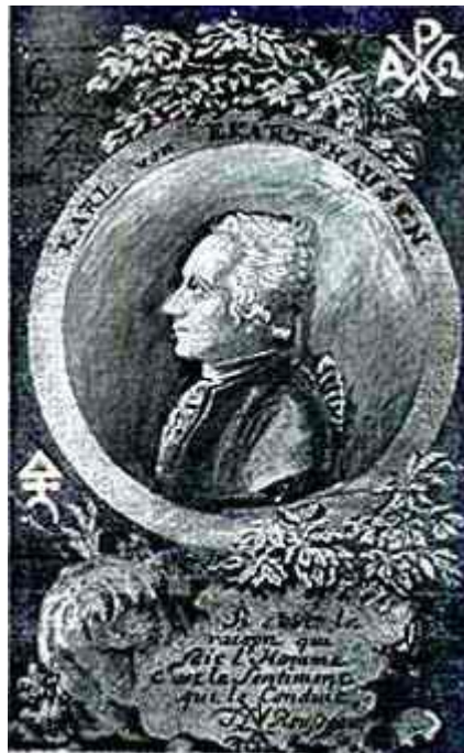
Karl von Eckhartshausen (1752-1803)

Published in six parts in the periodical "The Unknown World", 1895.