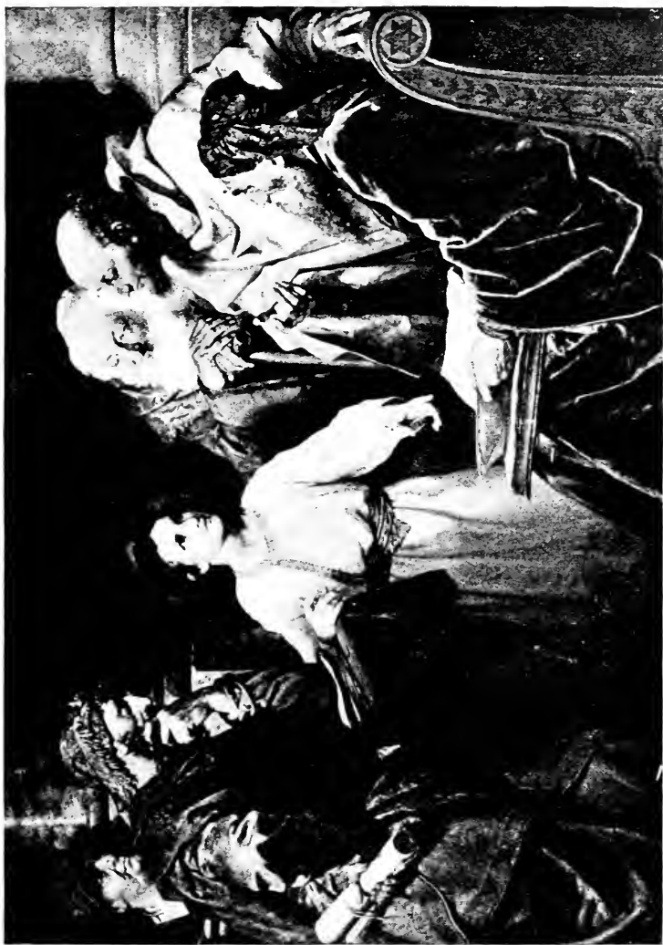
CHRIST DISPUTING WITH THE DOCTORS. (HOLZMANN.)