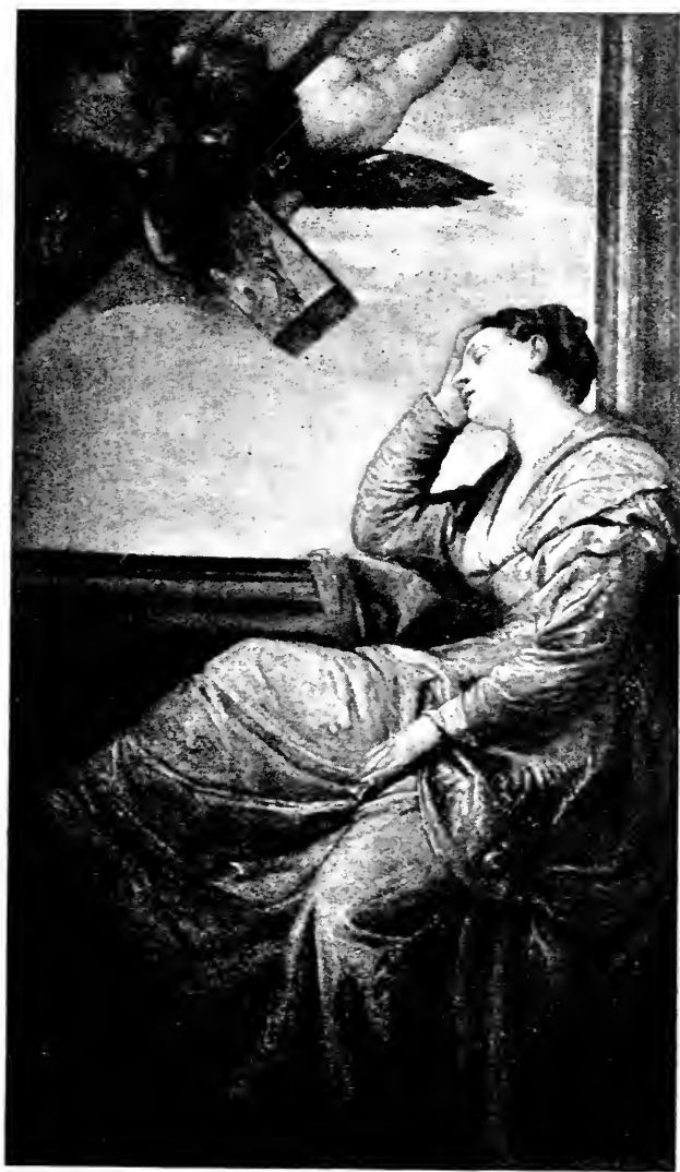
VISION OF SAINT HELENA.