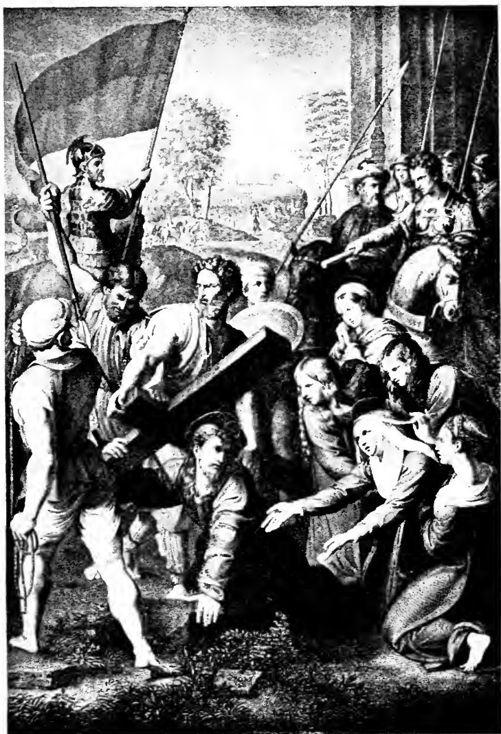
CHRIST BEARING THE CROSS. (RAPHAEL.)