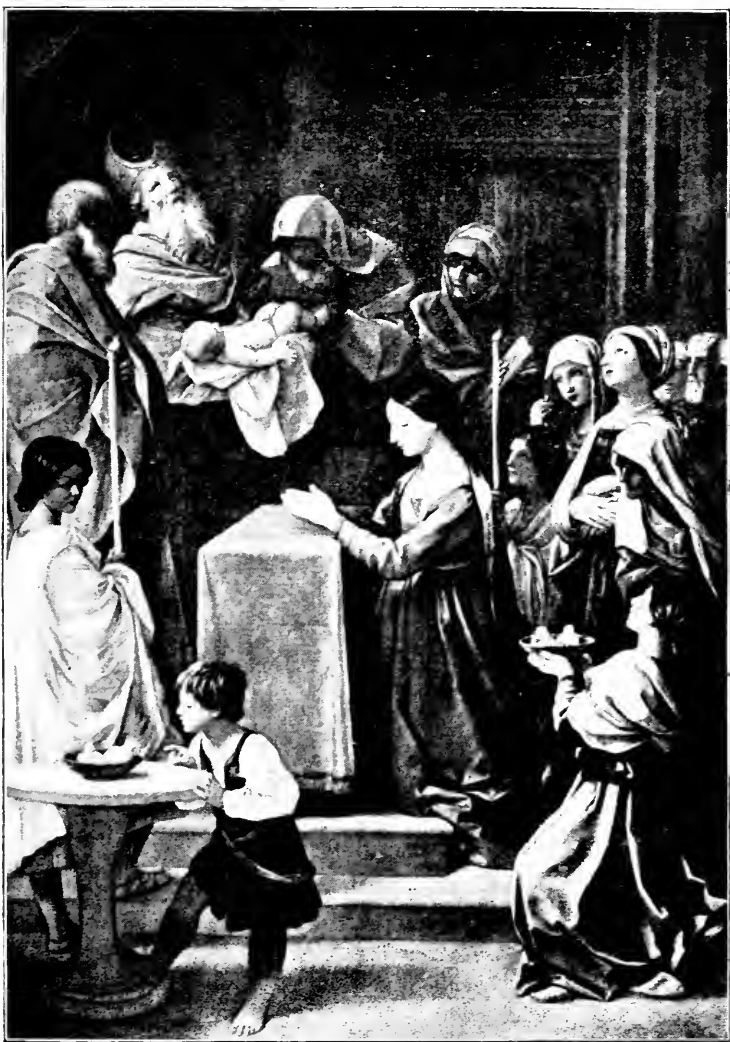
SIMEON AND THE INFANT CHRIST. (FRA BARTOLOMMEO.)