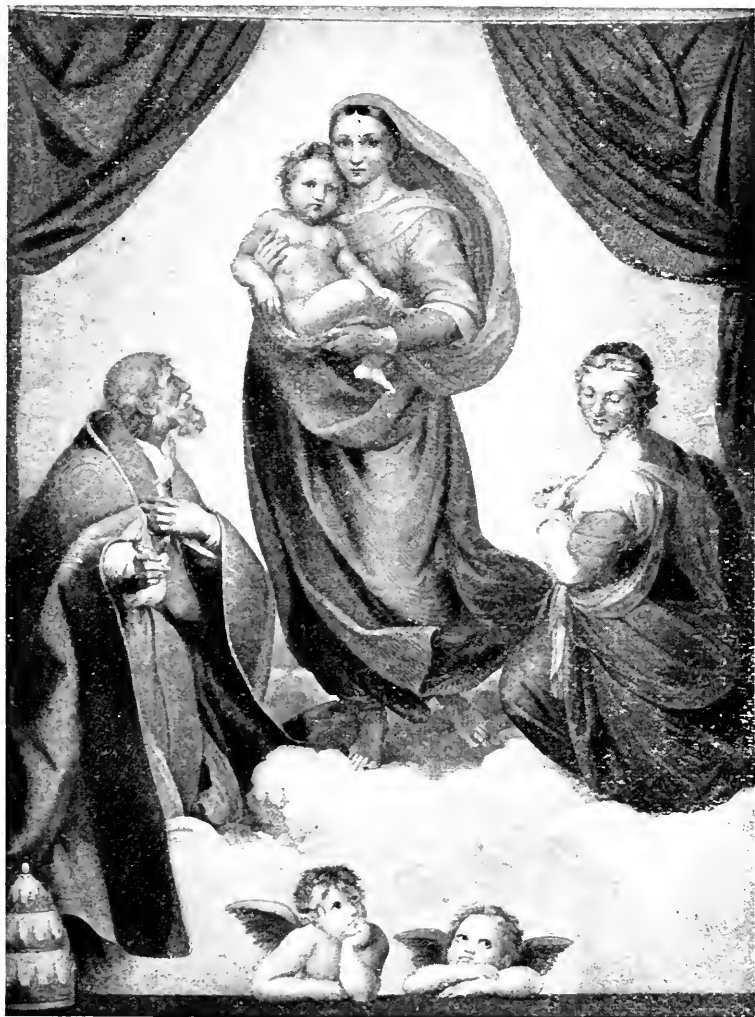
MADONNA DI SAN SISTO. (RAPHAEL.)