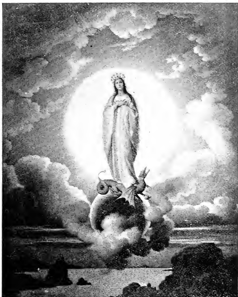
PREDESTINATION OF THE VIRGIN. (MÜLLER.)