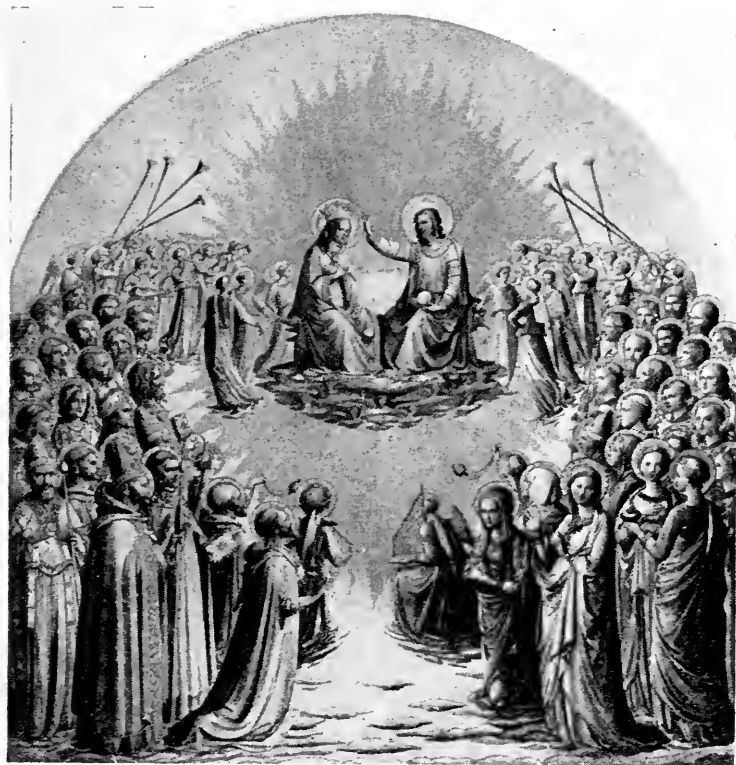
CORONATION OF THE VIRGIN.