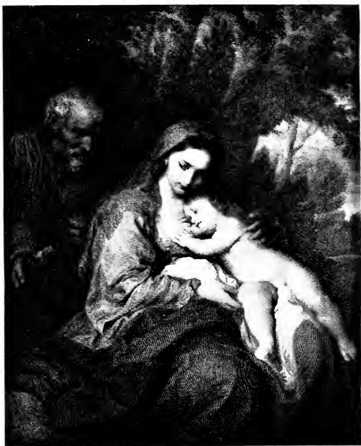
FLIGHT INTO EGYPT. (VAN DYCK.)