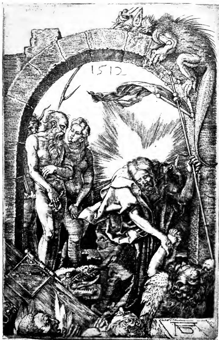
DESCENT INTO HADES.