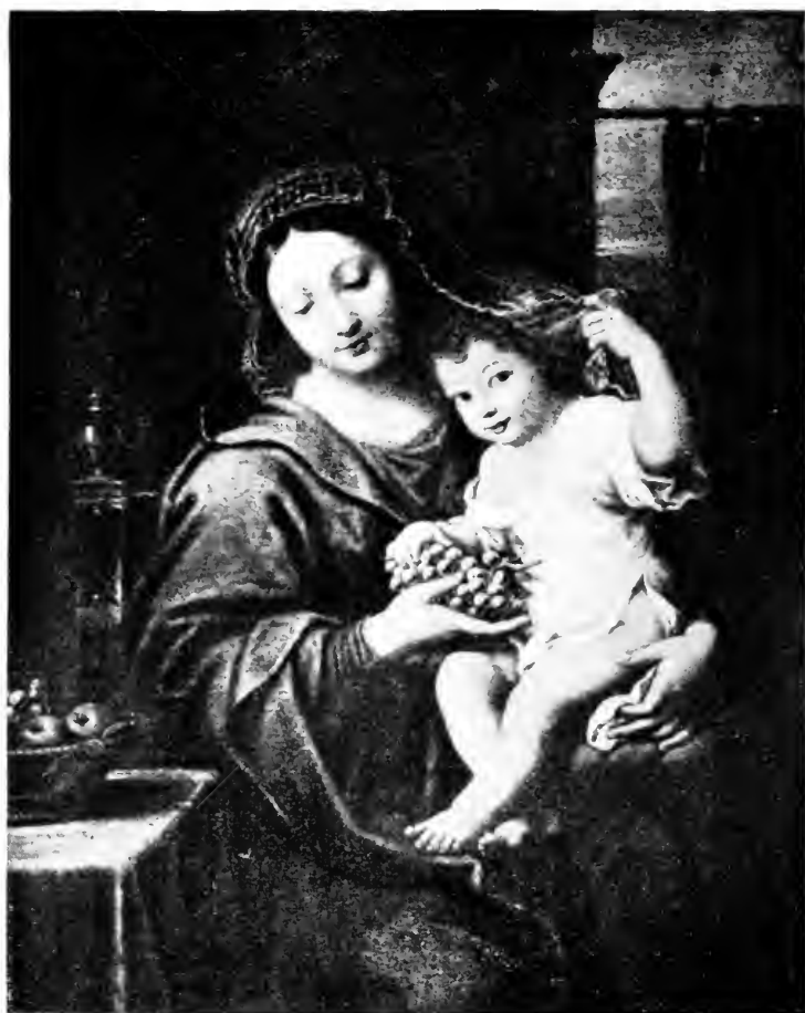
MADONNA AND CHILD. (MIGNARD.)