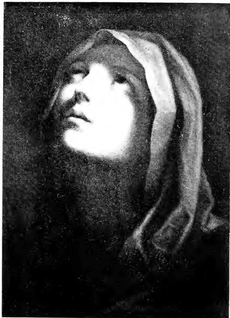
MATER DOLOROSA. (GUIDO RENI.)