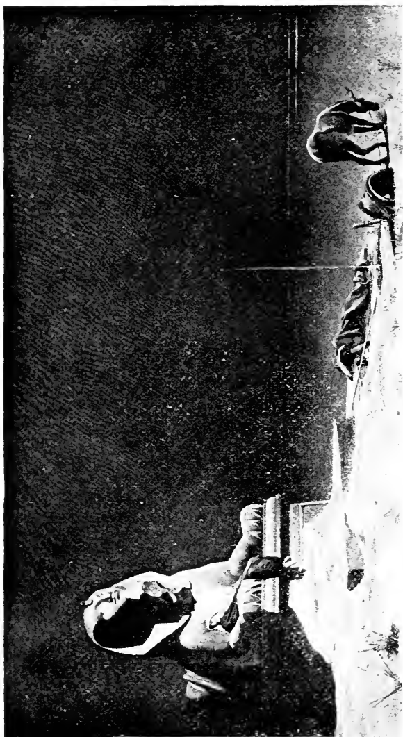
REPOSE IN EGYPT. (Misson)