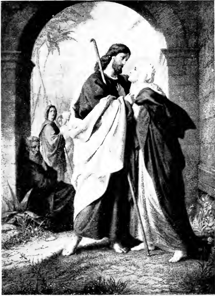
CHRIST TAKES LEAVE OF HIS MOTHER. (PLOCKHORST.)