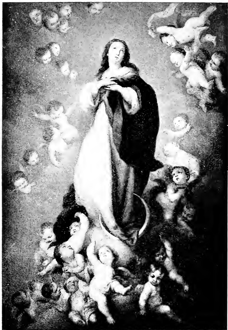
IMMACULATE CONCEPTION. (MURILLO.)