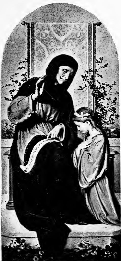
ST. ANNA AND THE VIRGIN MARY. (MÜLLER.)