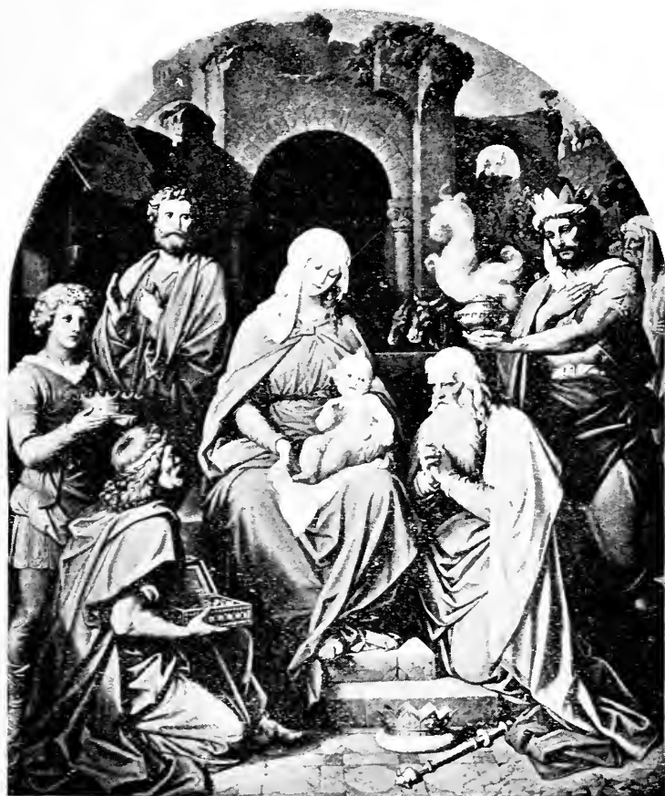
ADORATION OF THE KINGS. (PFANNSCHMIDT.)