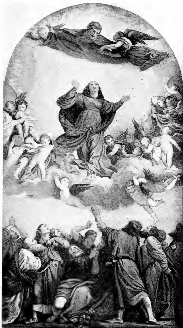
ASSUMPTION OF THE VIRGIN. (TITIAN.)