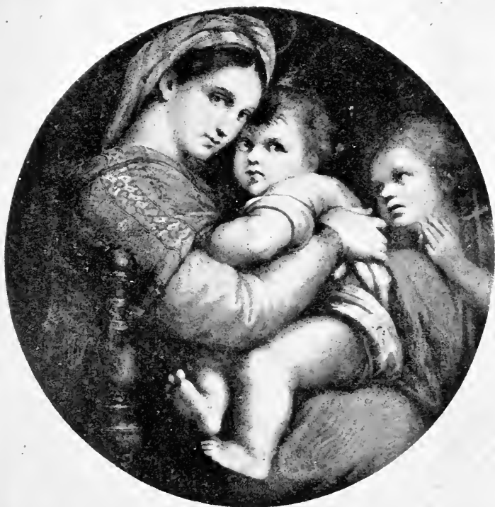
MADONNA DELLA SEDIA. (RAPHAEL.)