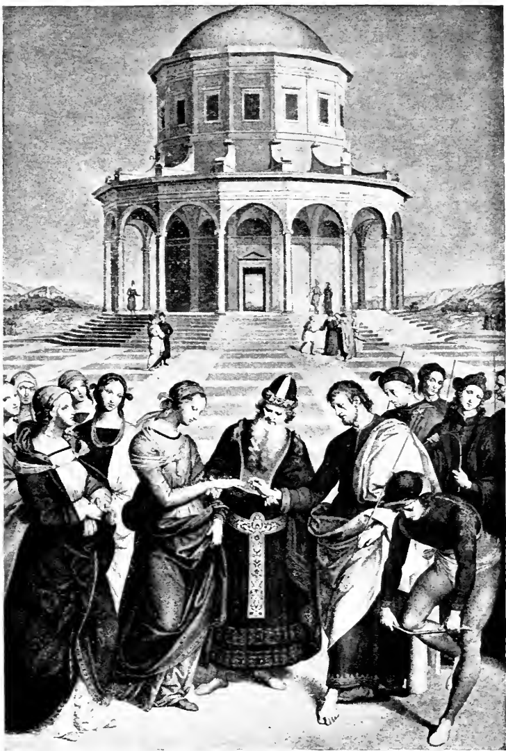
MARRIAGE OF THE VIRGIN. (RAPHAEL.)