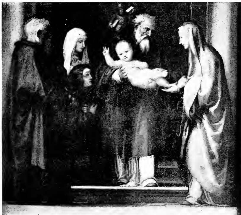
PRESENTATION OF THE VIRGIN IN THE TEMPLE. (GUIDO RENI.)