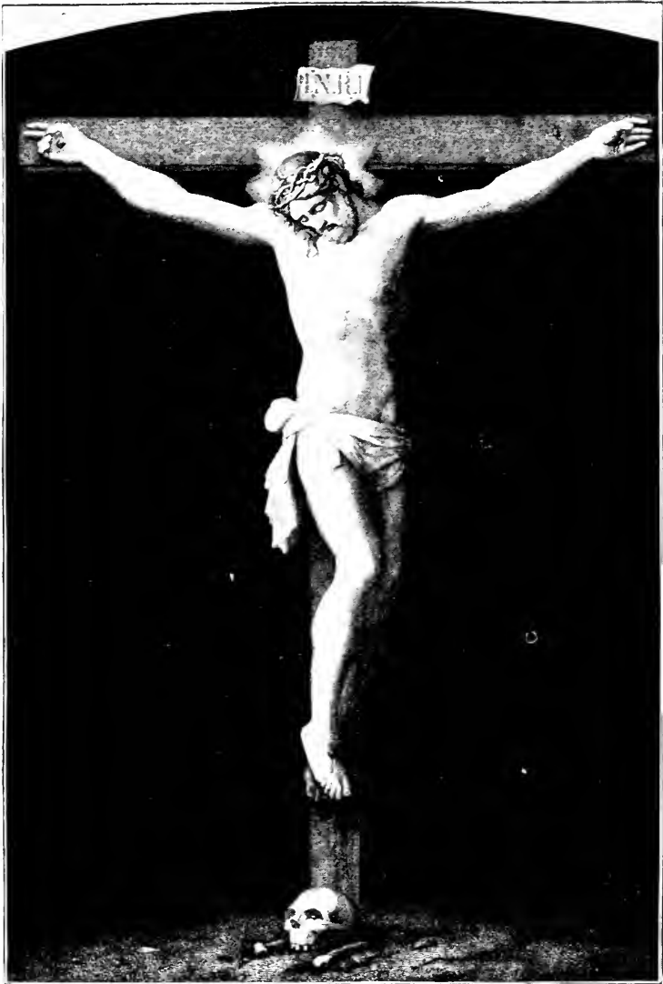
THE CRUCIFIXION. (MICHAEL ANGELO.)