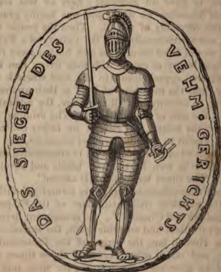
Seal of the Secret Tribunals.

to such times as it was hoped and believed never could return. Some of the courts were abolished; exemptions and privileges against them were multiplied; they were prohibited all summary proceedings; their power gradually sank into insignificance; and, though up to the present century a shadow of them remained in some parts of Westphalia, they have long been only a subject of antiquarian curiosity as one of the most striking phenomena of the middle ages. They were only suited to a particular state of society: while that existed they were a benefit to the world; when it was gone they remained at variance with the state which succeeded, became pernicious, were hated and despised, lost all their