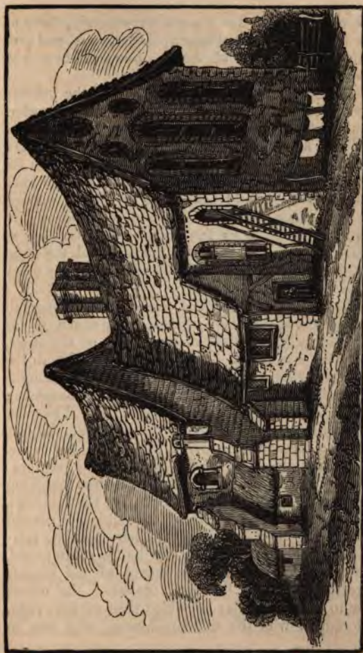
Preceptory, Swingfield, Dover