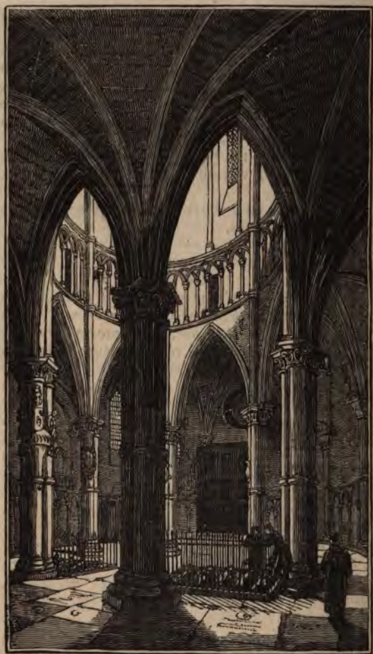
Interior of Round Tower, in Temple Church, London.