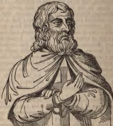
Portrait of last Grand Master.

companion were brought forth and placed upon it. They still persisted in their assertion of the innocence of the order. The flames were first applied to their feet, then to their more vital parts. The fetid smell of their burning flesh infected the surrounding air, and added to their torments; yet still they persevered in their declarations. At length death terminated their misery. The spectators shed tears at the view of their constancy, and during the night their ashes were gathered up to be preserved as relics.