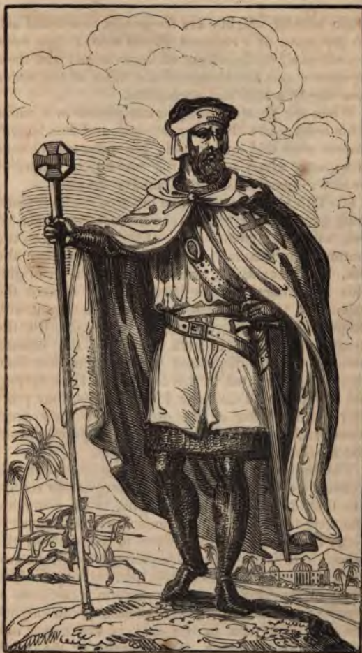
Costume of Knight Templar.