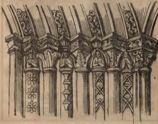
Details of Saxon Capitals.