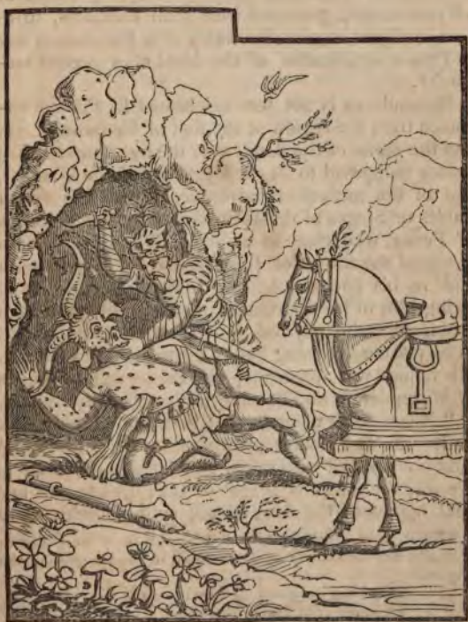
From the Shah Nameh, illuminated Persian MS.

selected it for the banner of the empire of Irân. Each succeeding prince, we are told, at his accession, added jewels to it, and Direfsh-e-Gavaneé blazed in the front of battle like a sun. Feridoon, then calling for smiths, drew for them in the sand the form of a club, with a cow's head at the end of it,