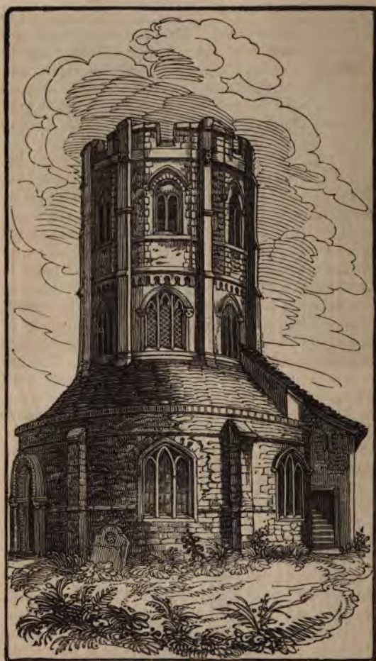
Round Temple Church, Cambridge.