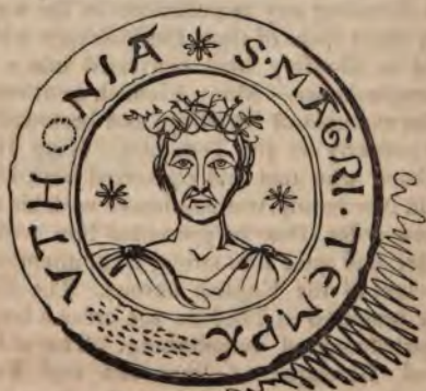
Seal of the Templars.

became a Templar, and took up his abode in the temple-house at Barcelona; and, as he could not go personally to combat the infidels in the Holy Land, he continually sent rich gifts to the brethren at Jerusalem, and he complied rigorously with all the other duties of the order. In 1133 Alfonso, king of Arragon and Navarre, a valiant and warlike monarch, who had been victor in nine and twenty battles against the Moors, finding himself old and without children, made a will, by which he appointed the knights of the Temple and of the Hospital, together with the canons of the Holy Sepulchre, to be his joint-heirs, deeming, perhaps, that the most gallant defenders of the Holy Land would best prosecute his favourite object of breaking the power of the infidels. The aged monarch fell the following year in the battle of Fraga, against the Moors; and, negligent of his disposition of the realm, the nobles of Arragon and Navarre met and chose sovereigns out of his family. The orders were not strong enough to assert their rights; and this instance, therefore, only serves to show the high degree of consideration to which they had so early attained.