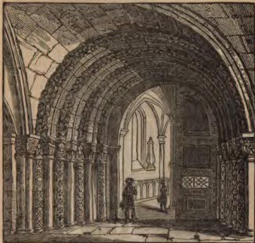
Saxon Doorway, Temple Church, London.