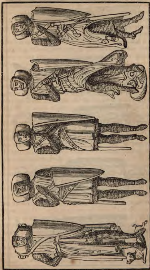
Knights in Temple Church, London.