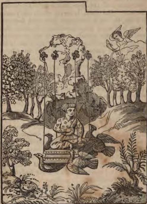
From the Same.

The history of the Shah-nameh ( King-book ), in which these legends are contained, is one of the most curious in literature. The fanaticism of the Arabs, who conquered Persia, raged with indiscriminate fury against the literature, as well as the religion, of that country; and when, in the time of Al-Mansoor and