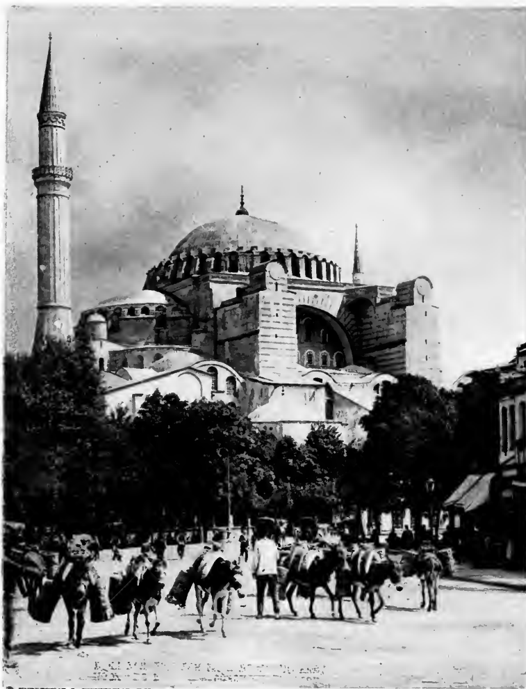
UNDERWOOD & UNDERWOOD, N.Y.