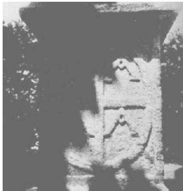
XLVIII. CYCLIC CROSS OF HENDAYE The four Sides of the Pedestal.